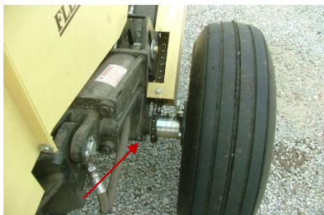
Drive wheel flat spot