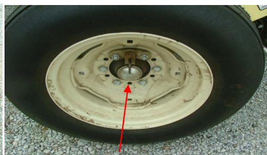
Drive wheel lock engaged