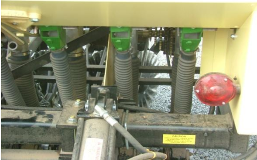
Seed drop tubes