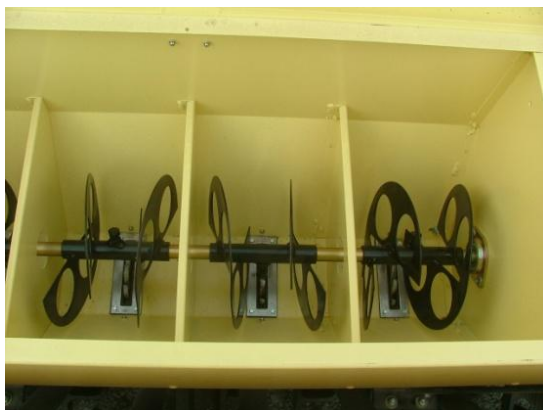
Fluffy seed box unit

Fluffy seed box (center) - has a large fluffy seed stirrer to improve seed flow of big bluestem, indiangrass, little bluestem, or warm season grass mixtures.