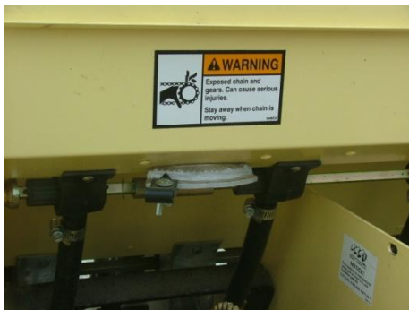
Small seed box unit

Small seed box (front) - wildflowers, alfalfa, trefoil, timothy, redbtop, switch grass & cool season mixes.