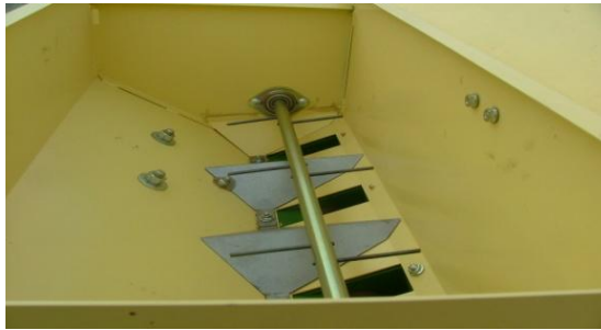
Cool season/grain box unit

Cool season/grain box (back) - has a small seed stirrer to improve seed flow of wheat, oats, sorghum, soybeans etc.